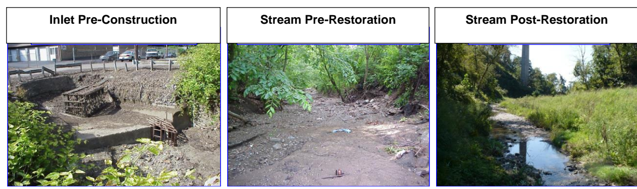
Figure A-4: ALCOSAN Direct Stream Inflow Removal and Stream Restoration at Jack's Run

ALCOSAN continues to target control of this inflow source as a high priority overflow control measure in coordination with customer municipalities. An example of a direct stream inflow removal and stream restoration at Jack's Run, located between Bellevue Borough and the City of Pittsburgh, is shown in Figure A-4.