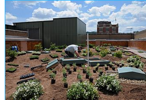
Figure A-6: Ongoing maintenance at the Allegheny County office building's green roof

The Wayne County, MI Stormwater Management Standards<sup>A-16</sup> require stormwater management systems to be maintained in perpetuity to ensure that they function effectively as designed and includes various enforcement provisions. The county issues a long-term maintenance permit for each project that identifies, among other items, the limits of the stormwater system, the party responsible for maintenance, and the activities required to ensure that the system functions effectively.