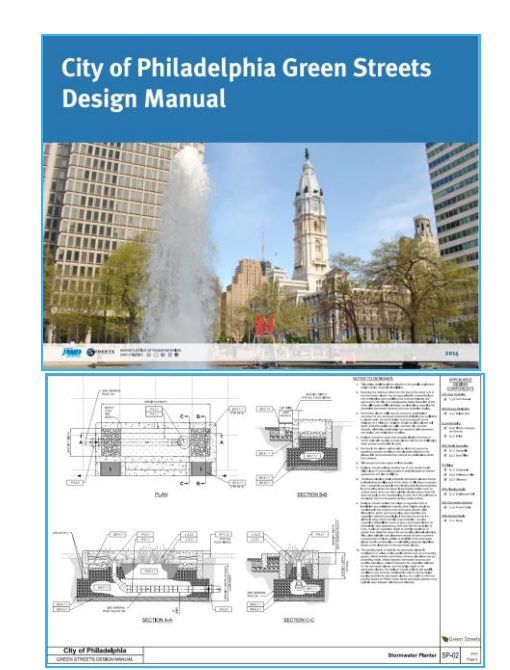
Figure A-5: The City of Philadelphia issued its GSI design manual in 2014

There is no federal guidance on how to develop GSI design manuals at a community level. Pennsylvania issued its Stormwater BMP Manual in 2006^{\text{A-13}} , with similar manuals developed in Maryland, Michigan, New York and other states.