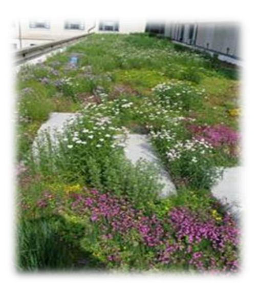
Figure A-2: Example of Green Roof at Carnegie-Mellon University

Applications of GSI are designed to fit the surrounding land use and desired functionality at the site. There are several basic types of GSI applications, and from these, various combinations and permutations are