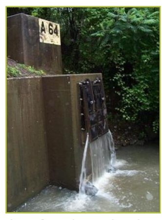
Combined Sewer Overflow

Some overflows occur by design since combined sewers, which are meant to carry wastewater and storm water together, become overloaded during wet weather. However, overflows also occur when excess groundwater enters the system through old, leaking and broken lines. Extraneous storm water and surface flow can enter the system through manhole lids and illicit residential connections, such as sump pumps and foundation drains. Another source of the problem stems from creeks that have been improperly directed into the sewer system.