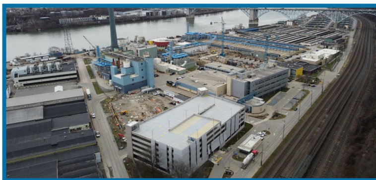
Parking Garage Opened