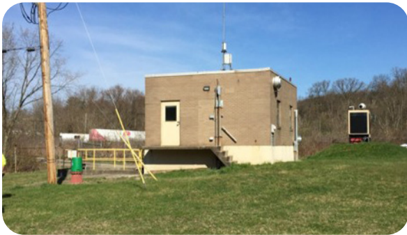
Current Oakdale Pump Station

ALCOSAN's original 537 Plan was approved in 1996, with amendments for the plant expansion and the regional conveyance facilities in 2018 and 2022, respectively. This special study is for the Oakdale Pump Station Project, which is also related to the North Fayette Township Act 537 Plan Special Study, approved in 2024.