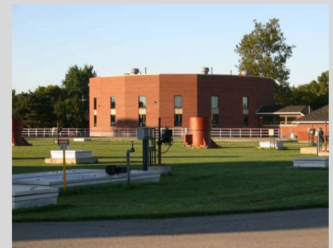
Milk River Combined Sewer Overflow Facility, located in St. Clair Shores, Michigan.

The CCBP has narrowed in on a most preferred basin alternative (described above) and will continue to optimize its performance while maintaining cost effectiveness. The alternative development and refinement process however